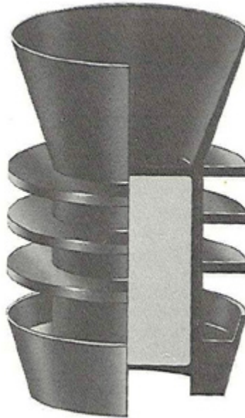
Top Rubber Plug

Industrial Rubber offers three types of Rubber Plugs, the Top Rubber Plug, Bottom Rubber Plug and the Omega (Ball-Type) Plug.